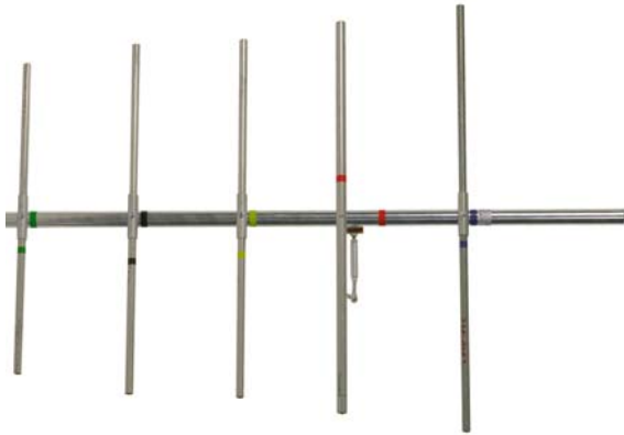
SAM-159 5 element YAGI antenna