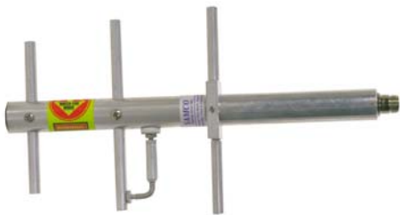
SAM-936 3 element YAGI antenna