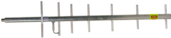
SAM-970 7 element YAGI antenna